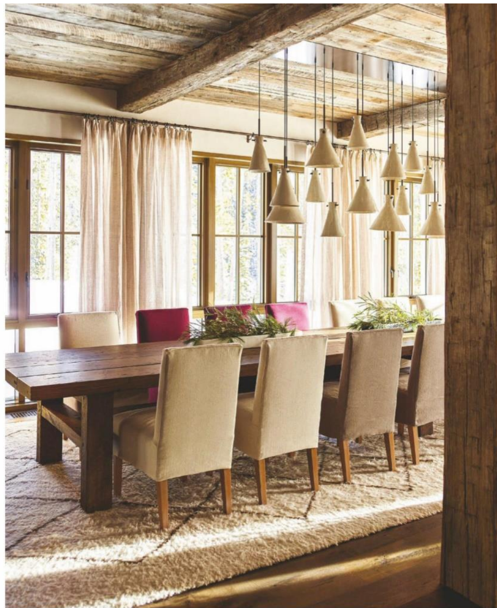
DINING ROOM The wood for the table was from a former water tower. A grouping of pendants delivers drama. Custom table and chairs, Kylee Shintaffer. Ceramic lights, BDDW; suspended by custom canopy, Kylee Shintaffer. Moroccan rug, Turabi Rug Gallery